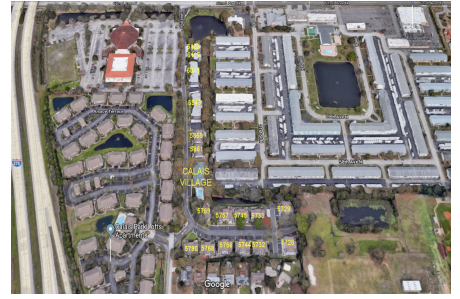
Built in 1984 - 104 units - 3 floors

CALAIS VILLAGE CONDOMINIUM ASSOCIATION, INC.