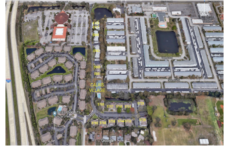
Built in 1984 - 104 units - 3 floors

CALAIS VILLAGE CONDOMINIUM ASSOCIATION, INC.