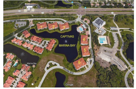
Built in 2008 - 48 units - 2 floors

Captivas at Marina Bay Condominium Association 5901 Sun Blvd Ste 203 Saint Petersburg, FL 33715 Phone number (727) 866-3115