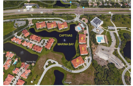
Built in 2008 - 48 units - 2 floors

Captivas at Marina Bay Condominium Association 5901 Sun Blvd Ste 203 Saint Petersburg, FL 33715 Phone number (727) 866-3115