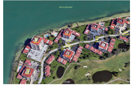
Built in 1977 - 117 units - 6 floors

Casa Del Mar III COA 6211 Sun Blvd Saint Petersburg, FL 33715 (727) 867-5167