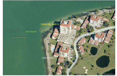
Built in 1978 - 119 units - 12 floors

Casa Del Mar III Coa 6211 Sun Blvd, Saint Petersburg, FL 33715 (727) 867-5167