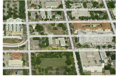
Built in 2006 - 15 units - 3 floors

CITY LOFTS SOUTH TOWNHOMES PROPERTY OWNERS ASSOCIATION, INC. TIERRA VERDE PROPERTY MANAGEMENT, LLC 1110 PINELLAS BAYWAY S STE 207 TIERRA VERDE FL 33715 PHONE 727-864-6468