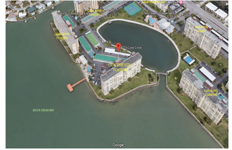
Built in 1971 - 107 units - 12 floors

Sea Towers Seminole Blvd, St. Petersburg, FL 33708, (727) 397-1164 seatowers@tampabay.rr.com http://www.seatowerscondos.com/seatowers/home.asp