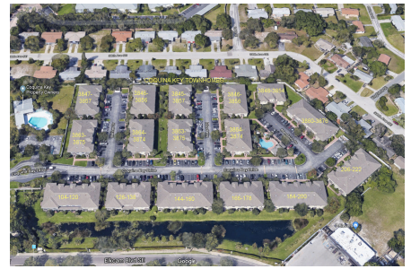
Built in 2005 - 136 units - 2 floors