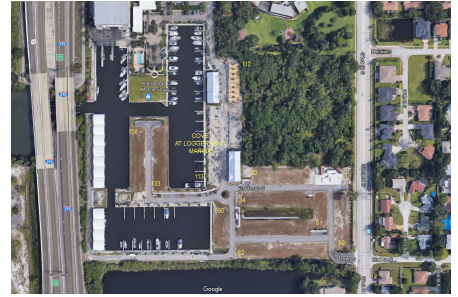
Built in 2014/2018 - 158 units - 2 floors

The Cove at Loggerhead Marina Association, Inc. c/o Castle Management, LLC 6301 Memorial Hwy Suite 103 Tampa, FL 33616 Phone:(800) 337-5850 Resident Services - 24/7 (800) 337-5850 ext. 6545 Property Manager https://www.coveatloggerhead.com/Page/4