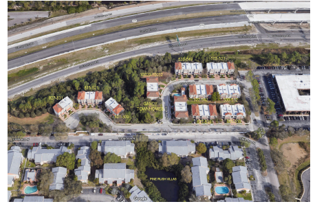
Built in 2007 - 44 units - 3 floors