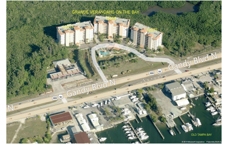
Built in 2004 - 84 units - 8 floors

http://www.associaonline.com/sites/associa-gulf-coast/Pages/Gulf-Coast-Property-