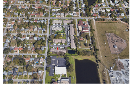
Built in 1971/1984 - 63 units - 2 floors