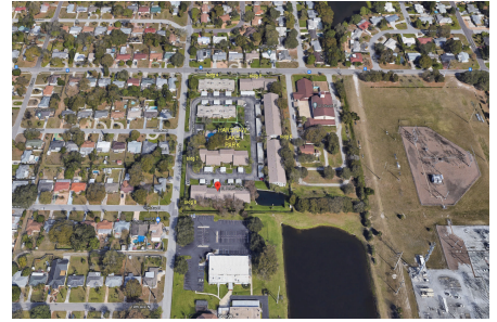
Built in 1971/1984 - 63 units - 2 floors