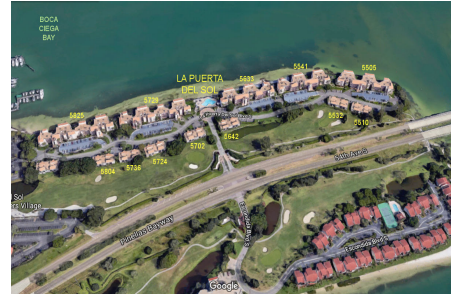
Built in 1978 - 279 units - 4 floors

LA PUERTA DEL SOL CONDOMINIUM ASSOC Main Address: 5901 SUN BLVD STE 103 ST. PETERSBURG Florida 33715