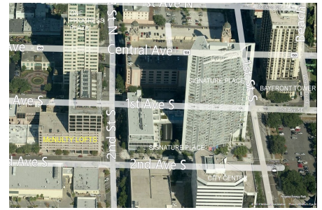
Built in 2006 - 83 units - 13 floors

McNulty Lofts Condominium Association (Rampart Properties, Inc.) Phone 727-577-2200 http://www.mcnultylofts.com