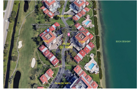
Built in 1980 - 127 units - 6 floors

Palma Del Mar Condominium Association No 3 970 Lake Carillon Drive # 102 Saint Petersburg, FL 33716 Phone: (727) 866-3115