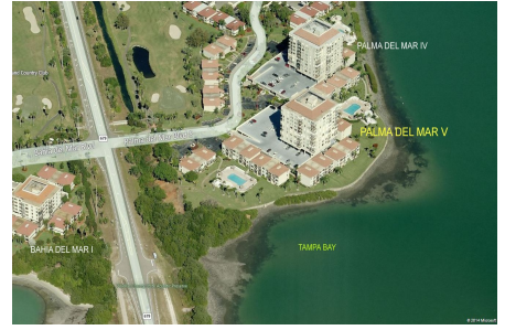
Built in 1981 - 140 units - 12 floors

Palma del Mar V management 3001 Executive Dr. Suite 260 Clearwater, FL 33762 (727) 573-9300 (answered 24 hours) Resource Property Management 727-864-0004 http://palma5.com/