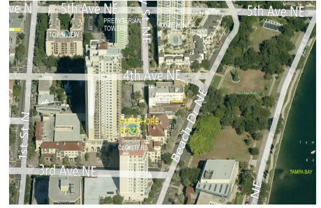
Built in 2006 - 116 units - 30 floors

Parkshore Plaza Condominium Association, Inc 300 Beach Dr NE OFC Saint Petersburg, Florida 33701-3471 (727) 823-4252