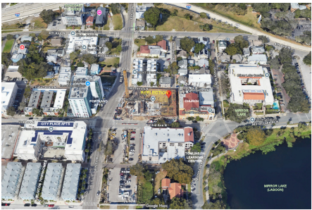
Built in 2024 - 88 units - 18 floors

Number of units: 88 Number of active listings for rent: 1 Number of active listings for sale: 11 Building inventory for sale: 12% Number of sales over the last 12 months: 3 Number of sales over the last 6 months: 2 Number of sales over the last 3 months: 1 REFLECTION CONDOMINIUM ASSOCIATION, INC. c/o Condominium Associates 570 Carillon Parkway Suite 210 St. Petersburg, FL 33716 https://reflectionstpete.com/contact/