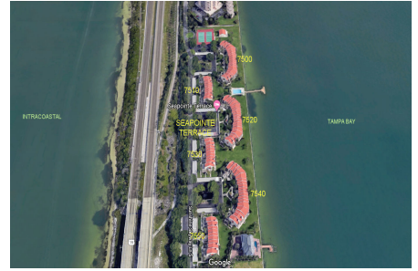
Built in 1982 - 108 units - 3 floors

Seapointe Terrace Address: 7520 Sunshine Skyway Ln S, St. Petersburg, FL 33711