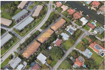
Built in 2006 - 18 units - 2 floors

Sun Ketch Construction Inc Address: 2401 28th Ave N, St. Petersburg, FL 33713 Phone: +1 727-592-0289