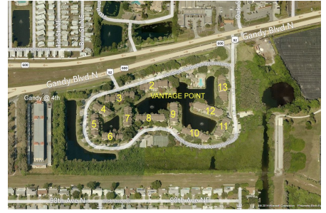
Built in 1988 - 379 units - 3 floors

VANTAGE POINT CONDOMINIUM OWNERS' ASSOCIATION, INC. 888-576-9601