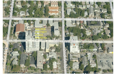
Built in 2007- 56 units - 15 floors

Walker-Whitney Plaza Condominium Association Inc Condominium Associates 3001 Executive Dr, Clearwater, FL 33762 (727) 573-9300