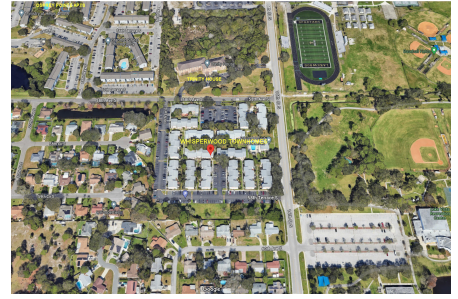
Built in 1979 - 120 units - 2

Whisperwood Townhomes Inc Address: 5825 16th St S, St. Petersburg, FL 33705 Phone: (727) 867-3909