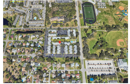
Built in 1979 - 120 units - 2

Whisperwood Townhomes Inc Address: 5825 16th St S, St. Petersburg, FL 33705 Phone: (727) 867-3909