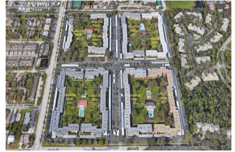
Built in 1971 - 114 units - 3 floors

Winston Park Northeast 5085 1st St NE, St. Petersburg, FL 33703 Phone: +1 727-528-7019