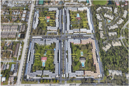
Built in 1973 - 102 units - 3 floors

Winston Park Northeast 5085 1st St NE, St. Petersburg, FL 33703 Phone: +1 727-528-7019