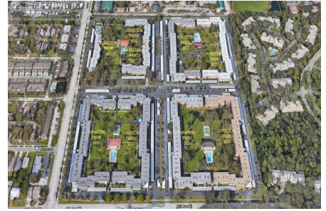
Built in 1973 - 102 units - 3 floors

Winston Park Northeast 5085 1st St NE, St. Petersburg, FL 33703 Phone: +1 727-528-7019