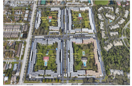
Built in 1979 - 102 units - 3 floors

Winston Park Northeast 5085 1st St NE, St. Petersburg, FL 33703 Phone: +1 727-528-7019