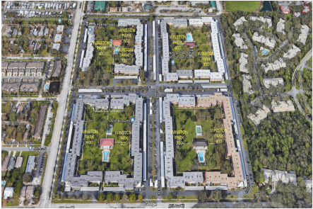
Built in 1979 - 102 units - 3 floors

Winston Park Northeast 5085 1st St NE, St. Petersburg, FL 33703 Phone: +1 727-528-7019