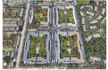
Built in 1975 - 102 units - 3 floors

Winston Park Northeast 5085 1st St NE, St. Petersburg, FL 33703 Phone: +1 727-528-7019