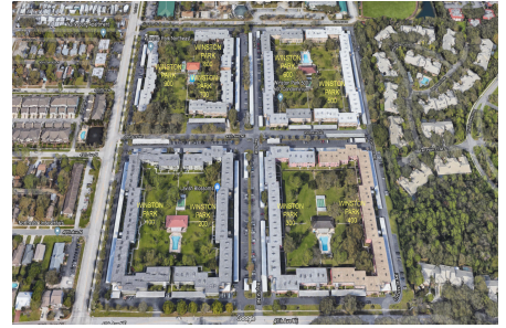
Built in 1981 - 114 units - 3 floors

Winston Park Northeast 5085 1st St NE, St. Petersburg, FL 33703 Phone: +1 727-528-7019