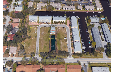
Built in 2009/2018 - 38 units - 3 floors

Number of units: 38 Number of active listings for rent: 1 Number of active listings for sale: 0 Building inventory for sale: Number of sales over the last 12 months: 0% Number of sales over the last 6 months: 0 Number of sales over the last 3 months: 0