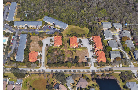
Built in 2007 - 22 units - 2 floors

Townhomes of Hidden Ridge Association Data Management Address: 36434 US Hwy 19 N, Palm Harbor, FL 34684 Phone: +1 727-799-0031 http://hoaofhiddenridge.com/