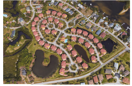
Built in 2006 - 80 units - 1 floor