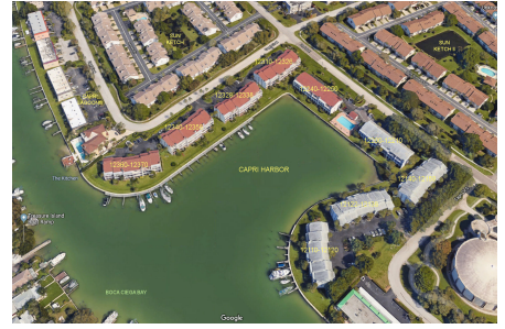
Built in 1982/1985 - 65 units - 3 floors

Capri Harbor Master Association Inc 250 104th Avenue Treasure Island, FL 33706 Phone: (727) 363-7606