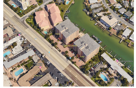
Built in 2007 - 20 units - 6 floors

Number of units: 20 Number of active listings for rent: 0 Number of active listings for sale: 2 Building inventory for sale: 10% Number of sales over the last 12 months: 1 Number of sales over the last 6 months: 0 Number of sales over the last 3 months: 0