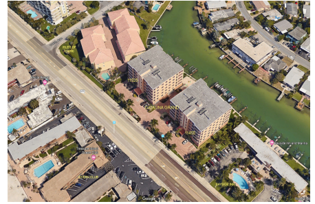
Built in 2007 - 20 units - 6 floors

Catalina Grand Treasure Island, FL 33706 C/O CONDO MANAGEMENT PLUS INC Address: 5666 Seminole Blvd #103, Seminole, FL 33772 Phone: +1 727-800-6101