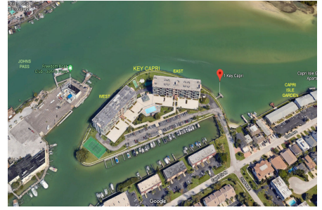
Built in 1974 - 176 units - 7 floors

Key Capri Condominium Association Address: 1 Key Capri St. Petersburg, FL 33706 Phone: +1 727-367-5416