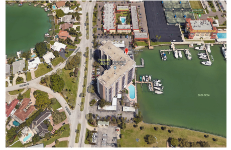
Built in 1963 - 149 units - 10 floors

Number of units: 149 Number of active listings for rent: 3 Number of active listings for sale: 14 Building inventory for sale: 9% Number of sales over the last 12 months: 7 Number of sales over the last 6 months: 4 Number of sales over the last 3 months: 4