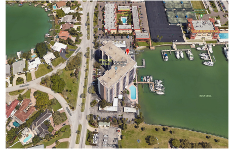
Built in 1963 - 149 units - 10 floors