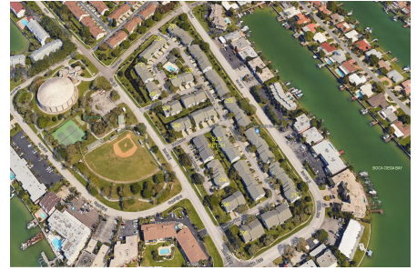
Built in 1985/1989 - 97 units - 2 floors