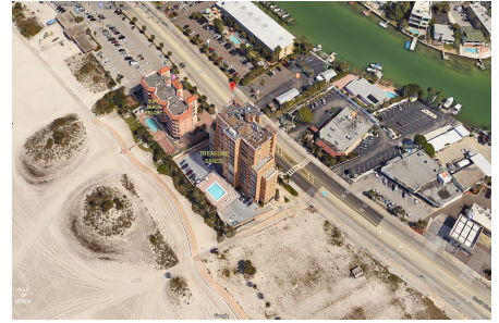
Built in 1974 - 46 units - 15 floors

Treasure Sands Condominium Address: 11000 Gulf Blvd, Treasure Island, FL 33706 Phone: +1 727-367-2029