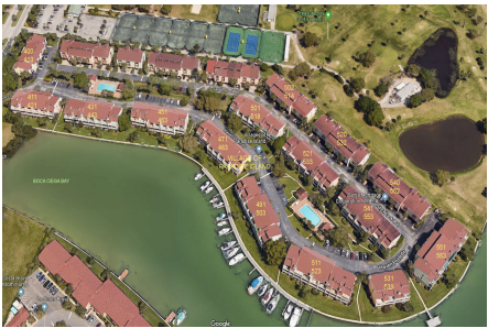
Built in 1980 - 98 units - 3 floors