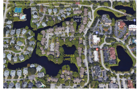
Built in 1983 - 70 units - 2 floors

Crane's Lake One Condominium Association Inc. Cranes Lake Drive, Jacksonville, FL 32082 (904) 460-2785 http://craneslake1.com