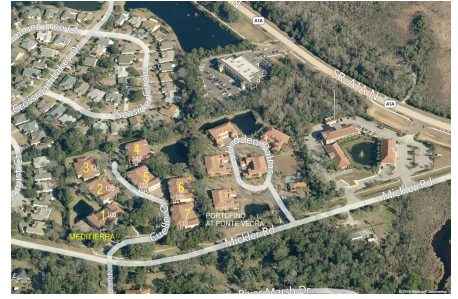
Built in 2006 - 26 units - 2 floors

MEDITIERRA AT PONTE VEDRA CONDOMINIUM ASSOCIATION, INC. MAY MANAGEMENT SERVICES INC 10036 SAWGRASS DR W # 1 POINTE VEDRA BEACH FL 32082 PHONE 904-561-9708 FAX 904-461-0335