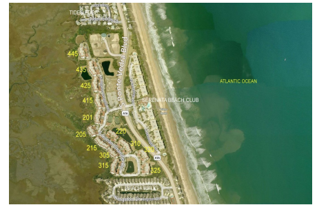
Built in 2002 - 198 units - 3 floors

OCEAN GRANDE CONDOMINIUM ASSOCIATION, INC. MAY MANAGEMENT SERVICES INC 475 WEST TOWN PLACE # 112 ST AUGUSTINE FL 32092 PHONE 904-561-9708 FAX 904-461-0335 http://www.maymgt.com/oceangrande/home.asp