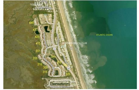
Built in 2002 - 198 units - 3 floors

OCEAN GRANDE CONDOMINIUM ASSOCIATION, INC. MAY MANAGEMENT SERVICES INC 475 WEST TOWN PLACE # 112 ST AUGUSTINE FL 32092 PHONE 904-561-9708 FAX 904-461-0335 http://www.maymgt.com/oceangrande/home.asp