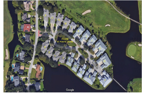
Built in 1990 - 73 units - 2 floors

Number of units: 73 Number of active listings for rent: 0 Number of active listings for sale: 0 Building inventory for sale: Number of sales over the last 12 months: 0%% Number of sales over the last 6 months: 2 Number of sales over the last 3 months: 1