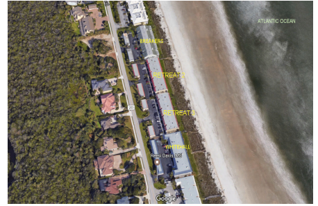
Built in 1985 - 32 units - 2 floors

Mailing address: P. O. Box 330026, Atlantic Beach, FL 32233 Management office location: 1825-A North Third Street, Jacksonville Beach, FL 32250 Telephone 904-249-8599 Fax 904-249-8598 http://marvin-group.com/ponte-vedra-retreat-iii-condominium-association/