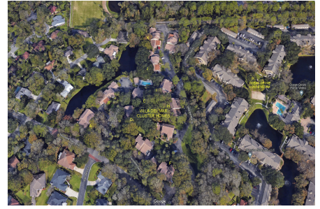
Built in 1975 - 48 units - 2 floors

VILLA DEL MAR CLUSTER HOMES Main Address: THOUSAND OAKS BOULEVARD PONTE VEDRA BEACH Florida 32082