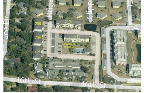
Built in 2000 - 66 units - 3 floors

ANASTASIA BY THE SEA OWNERS ASSOCIATION, INC. JACOBS AND ASSOCIATES, INC. 461 A1A BEACH BLVD SAINT AUGUSTINE FL 32080 PHONE 904-461-5556