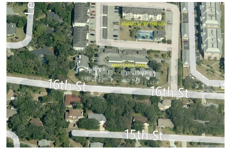
Built in 1986 - 22 units - 3 floors

ANASTASIA OAKS CONDOMINIUM ASSOCIATION, INC. MAY MANAGEMENT SERVICES INC 475 WEST TOWN PLACE # 112 ST AUGUSTINE FL 32092 PHONE 904-561-9708 FAX 904-461-0335