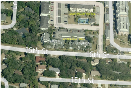
Built in 1986 - 22 units - 3 floors

ANASTASIA OAKS CONDOMINIUM ASSOCIATION, INC. MAY MANAGEMENT SERVICES INC 475 WEST TOWN PLACE # 112 ST AUGUSTINE FL 32092 PHONE 904-561-9708 FAX 904-461-0335