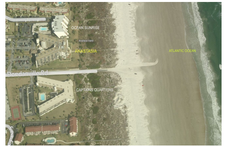
Built in 1975 - 110 units - 7 floors

Anastasia managed by Coastal Realty 800-458-7345 800-587-2287 http://www.anastasiacondos.com/