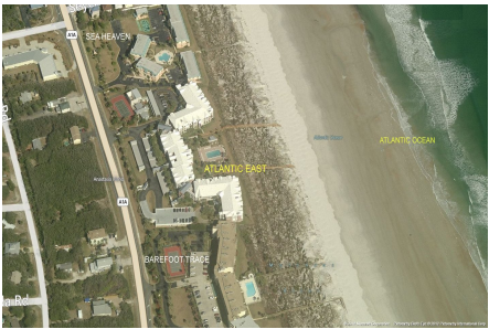
Built in 1986 - 69 units - 3 floors

Atlantic East Condominium Association 6170 A1A South Saint Augustine, FL 32080 Phone: (904) 471-9300