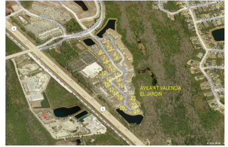
Built in 2004 - 184 units - 2 floors

Avila El Jardin Condominium Association Inc 1960 US 1 South 7 Saint Augustine, FL 32086 (904) 819-9830