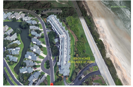
Built in 1989 - 61 units - 3 floors

Villages of Vilano HOA c/o Coastal Realty & Property Management 3942 A1A South, St. Augustine, FL 32080 Ph: 904-471-6606 Fax: 904-471-2866 https://villagesofvilano.wordpress.com/